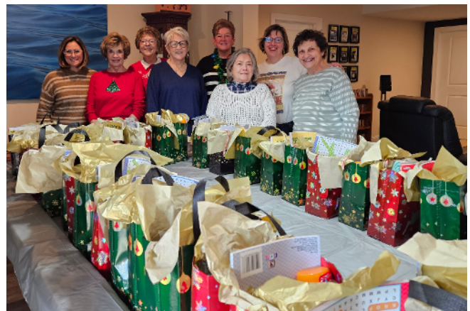
KDO Members Filling the Bags